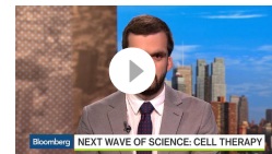
The Next Wave of Science: Will FDA Approve Cell Therapy?