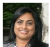
Sahana Dodballapur Coldwell Banker Residential Brokerage